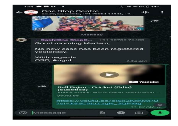
Day-15 Workshop on Good Touch-Bad Touch