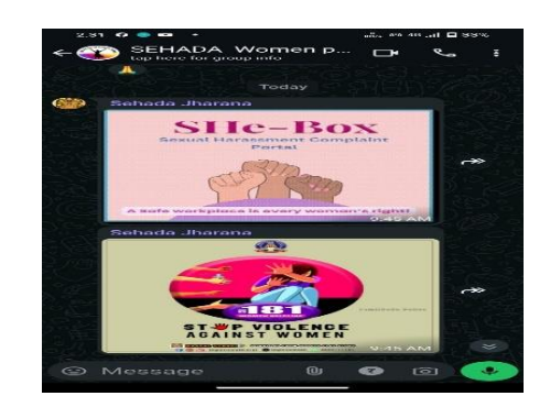
Day-11- Positive Masculinity Workshop