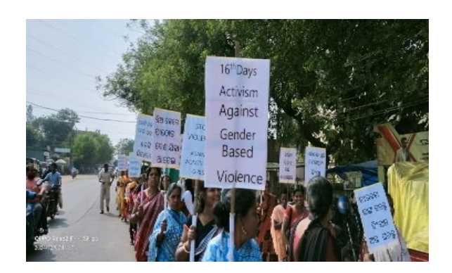
Day-14-Infographic and Video Distribution