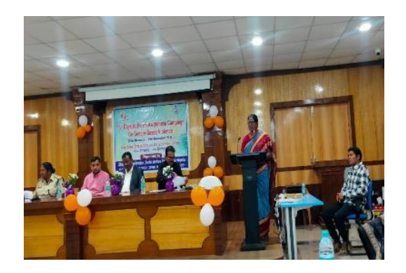
Day-16-Human Rights Day Closing Ceremony